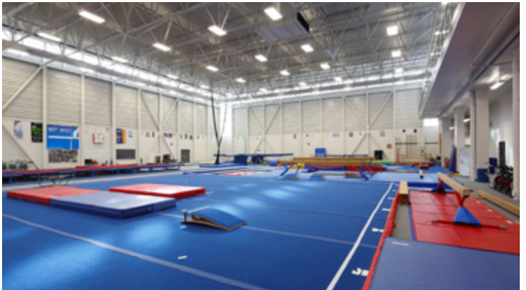
Gymnastics Lessons - Airdrie Edge Gymnastics Club